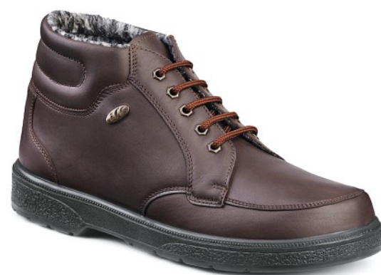
RUDO HIGH III insulated // 727 247/V - DIA RUDO HIGH III insulated // 727 247/VF - FLEXI anti-slippery sole ↗

Material: textile Size: 39-48 Colour: blue