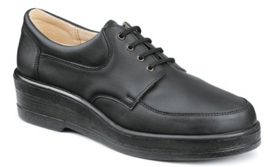
OLA CLASSIC // 727 843/C - DIA OLA CLASSIC // 727 843/C - FLEXI ↗