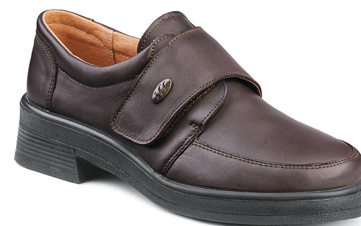
↖ OLA WELCRO // 727 843/W - DIA OLA WELCRO // 727 843/W - FLEXI