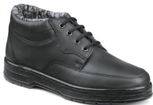
↖ GT HIGH // 727 247/GTV - DIA GT HIGH // 727 247/GTV - FLEXI anti-slippery sole