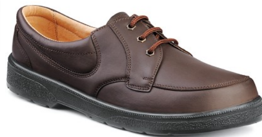
RUDO I lace // 727 247/R - DIA RUDO I lace // 727 247/F - FLEXI ↗