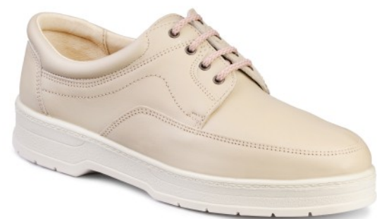
GT - 727 247/GT - DIA GT - 727 247/GT - FLEXI ↗