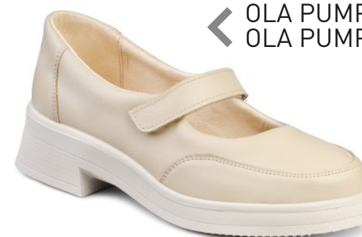
↖ OLA PUMPS // 728 843/L - DIA OLA PUMPS // 728 843/L - FLEXI