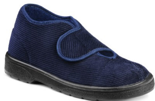
↖ RUDO SLIPPER // P - DIA RUDO SLIPPER // P - FLEXI

Material: textile Size: 39-48 Colour: blue