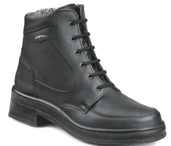
OLA HIGH // 727 843/VYS - DIA OLA CLASSIC // 727 843/VYS - FLEXI ↗