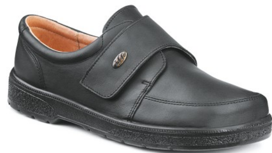
↖ RUDO II WELCRO // 727 247/RW - DIA RUDO II WELCRO // 727 247/FW - FLEXI